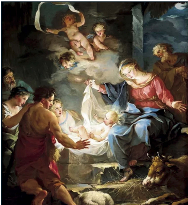
'Nativity,' Jean-Baptiste Marie Pierre