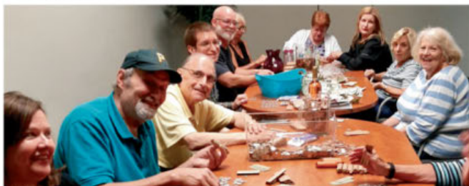
Members above are counting cash for a good cause

Thank you to the parish for generously donating $4,489.77 to our recent Baby Bottle collection. Whether you were able to give a substantial donation or scraped the penny jar, each cent donated counts and will benefit Moms, Dads and our tiniest brothers and sisters in need. Thank you for the notes we received saying "Thanks," "God Bless You," and the one on the check that stated "He is Risen!!!" A shout out to the families who had the lemonade stands, and the clever competitions between family members to see who could collect the most. We are so proud to belong to this parish where life is valued, celebrated, and supported. Your selfless donations will be shared with Birthright, Mary's Place, Little Lamb and the KOC (who is supporting a young family, Mom, Dad, a 3 year old and an unborn baby, who are homeless) We are so grateful to each and every one of you! God bless you!!! If you still have a bottle, empty or full, please return it to the parish office ASAP.